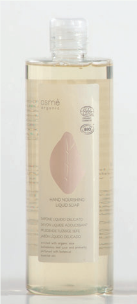
FLR400LMSM Hand nourishing liquid soap 380 ml