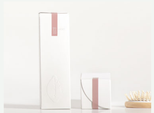
EM045FSM ESSENTIAL BODY CARE FOR LADIES *Dental kit containing a Colgate toothpaste, a soft bristle toothbrush, a Colgate Plax mouthwash and disposable dental floss *Nail kit containing a nail buffer and cherry wood stick for cuticles *Ultra-thin sanitary pad and a OB sanitary tampon *Wooden hairbrush