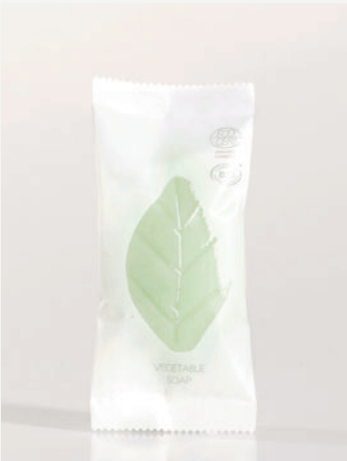
B1218SM Vegetable soap 18 gr