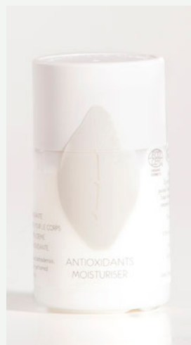
P39BLSM Hand & body moisturiser 38 ml