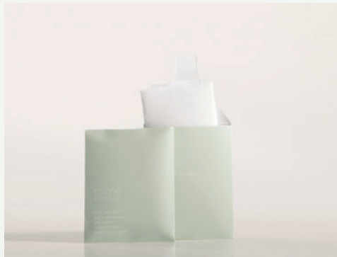
F03SM shoe shine glove