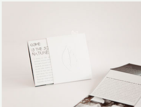
SCRTSM Advertising card