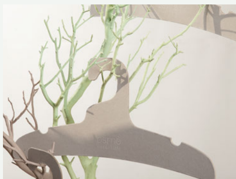
AP045SM Clothes hanger