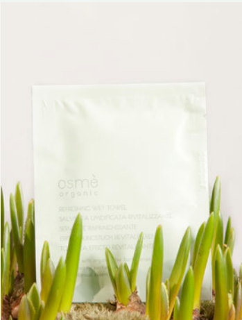
AB50SM refreshing wet towel suitable for use on the hand & face