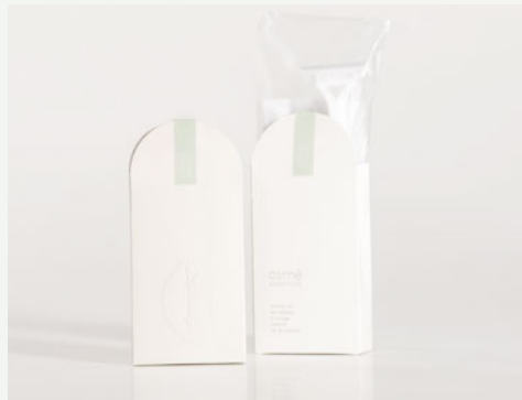
EO114SM shaving set