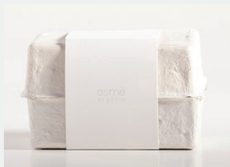
K065SM Eggbox gift box contains: bottle of shampoo, bath gel & body lotion: vegetable soap and amenities kit.

The eggbox is made of paper pulp from 100% post consumer recycled paper.