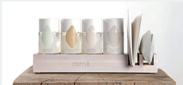
I075SM Bamboo tray