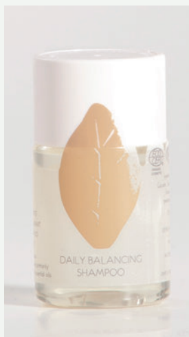
P39SSM Daily balancing shampoo 38 ml