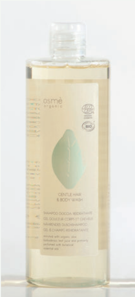
FLR400MSM Gentle hair & Body wash 380 ml