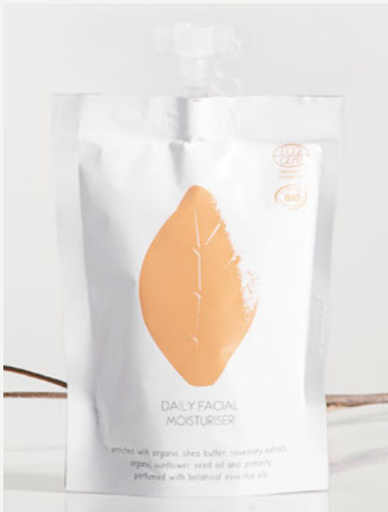
DYP10_20CVSM Daily facial moisturiser 20 ml