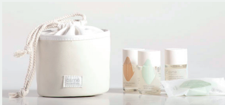
K075VSM Essentials kit pouch