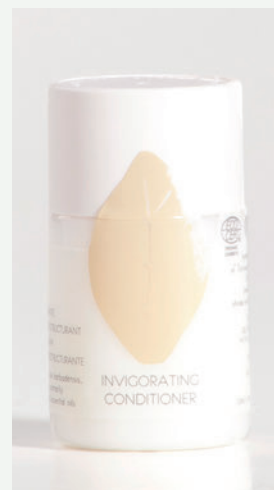
P39CSM Invigorating conditioner 38 ml