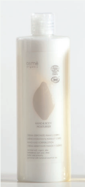
FLR400BLSM Hand & body moisturiser 380 ml