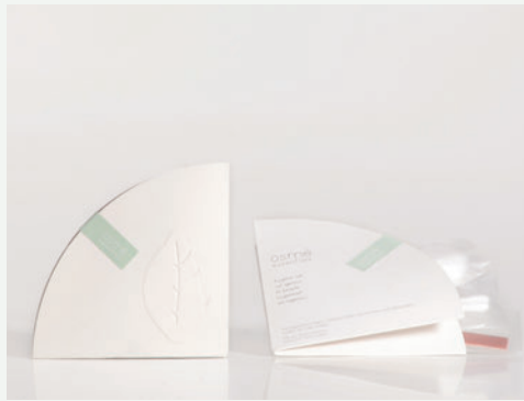
DE024SM hygienic set