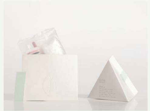
K045PSM shower cap, hygienic set, sewing kit