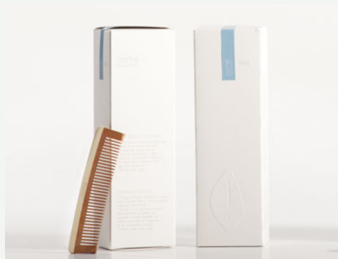
EM045MSM ESSENTIAL BODY CARE FOR MEN *Shaving kit containing a Gillette triple bladed sensor razor and Gillette shaving foam for normal skin *Dental kit containing a Colgate toothpaste, a soft bristle toothbrush, a Colgate Plax mouthwash and disposable dental floss *Wooden hair comb