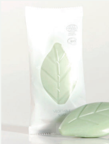
B1236SM Vegetable soap 35 gr