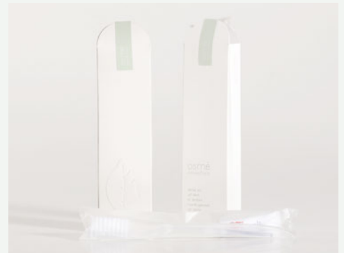
EO94SM dental set