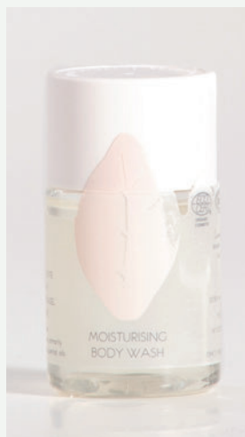
P39BSM Moisturising body wash 38 ml