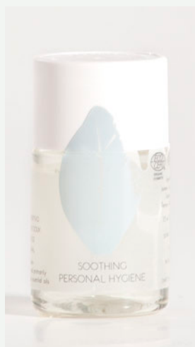
P39IGSM Soothing personal hygiene 38 ml