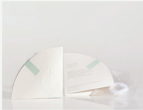
CO24SM shower cap and hair band