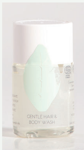
P39MSM Gentle hair & body wash 38 ml