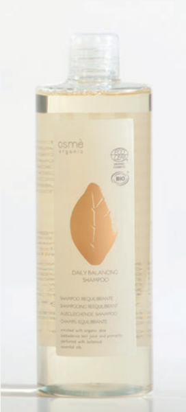
FLR400SSM Daily balancing shampoo 380 ml