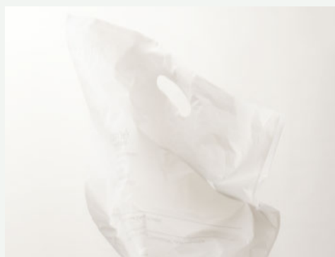
G06V6SM Laundry bag