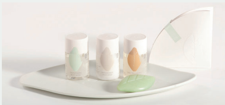
I045SM Leaf shaped tray