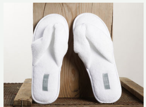
F085SM Room slipper