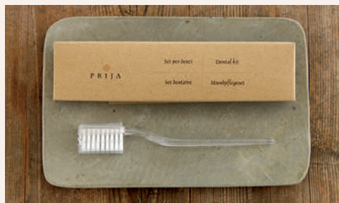
E081PR Dental kit