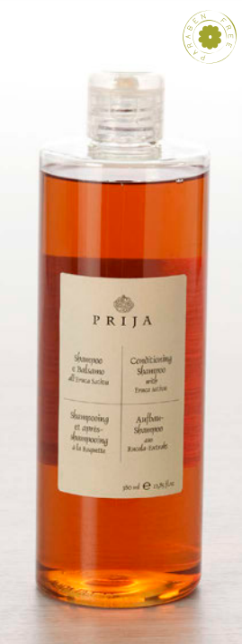
FLR400SPR Conditioning Shampoo with Eruca sativa 380 ml

What characterises Prija’s cleansers and creams are their plants’ extracts coming from various western and eastern botanical regions. You will enjoy their natural beneficial properties thanks to the composition of creams and cleansers that were studied to be hypoallergenic, and to their special aromatherapy scents.