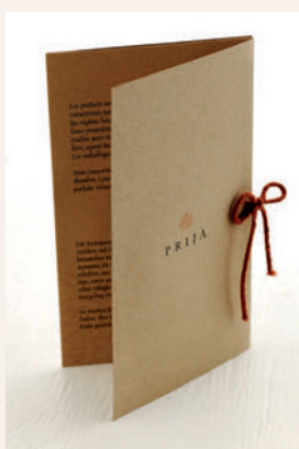
CART2PR Reception tag with indication of Prija range