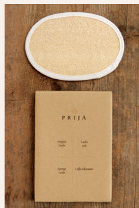
SP091PR Loofa pad