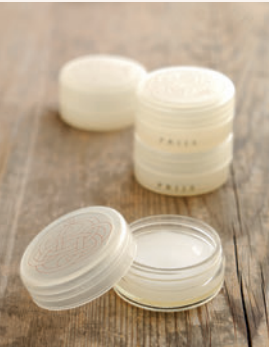
LB01PR Emollient lip balm 5 g