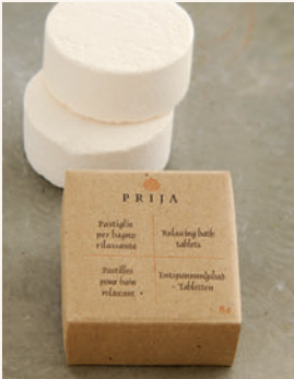
L01PR Relaxing bath tablets 35 g

What characterises Prija’s cleansers and creams are their plants’ extracts coming from various western and eastern botanical regions. You will enjoy their natural beneficial properties thanks to the composition of creams and cleansers that were studied to be hypoallergenic, and to their special aromatherapy scents.