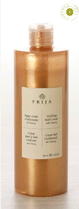
FLR400BPR Vitalising Bath Cream with Ginseng 380 ml