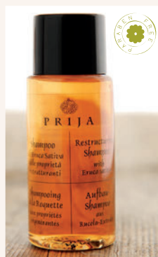
PET44SPR Restructuring Shampoo with Eruca Sativa 40 ml