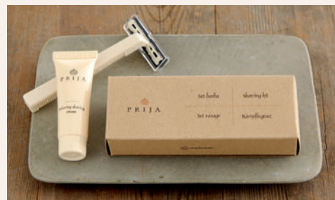
E0111PR Shaving kit