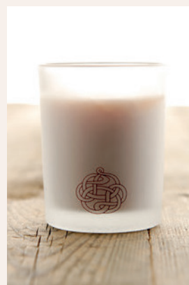
L09PR Scented Candle