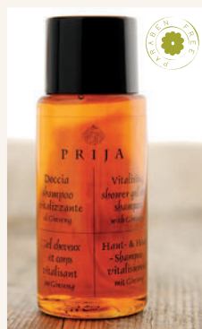
PET44PR Vitalising shower gel and shampoo with Ginseng 40 ml