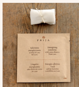
AB36EPR Energising towelette with Lotus Flowers from Laos 4 ml

Fine ingredients and exotic fragrances: Prija is a warm and earthy complimentary line. Produced by GFL according to very high qualitative standards, it appeals to customers who are sensitive to the quality of cosmetics, and to the design of complimentary items.