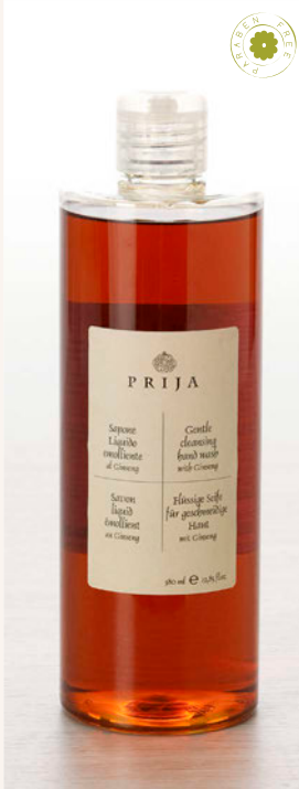
FLR400LMPR Gentle cleansing hand wash with Ginseng 380 ml