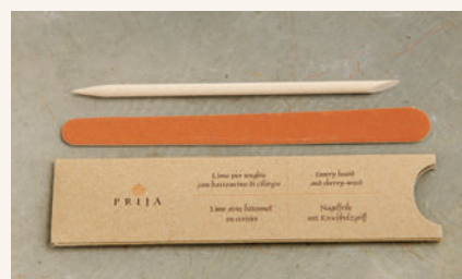
E02PR Emery board and cherry-wood