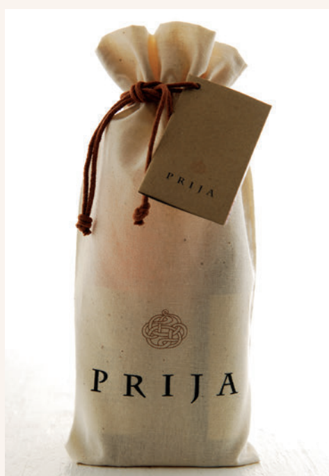
KIT1NPR Kit, contains: FLR400LMPR, FLR400BLPR