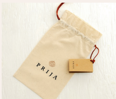
SACNEUPR Sack for amenity items