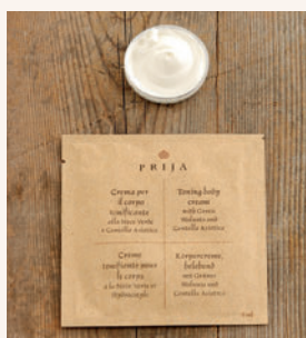
AB34CPR Toning body cream with Green Walnuts and Centella Asiatica 6 ml