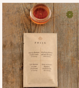
AB01PR Vitalising shower gel and shampoo with Ginseng 10 ml