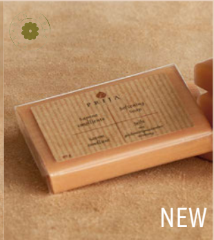
B1640PR Softening soap 40 g