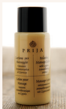
PET44LPR Relaxing Massage Lotion with Cypress Aromathera- py product 40 ml