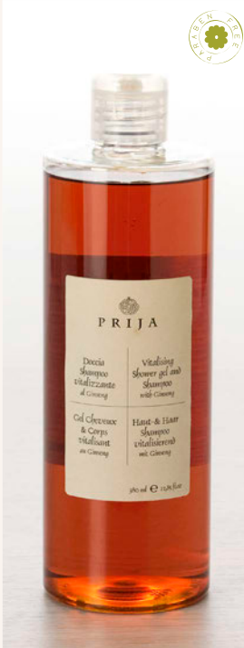
FLR400PR Vitalising shower gel and shampoo with Ginseng 380 ml