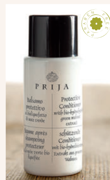
PET44CPR Protective Conditioner with bio-hydrolyzed green walnut extract 40 ml