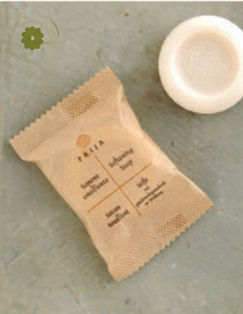
B09PR Softening soap 15 g