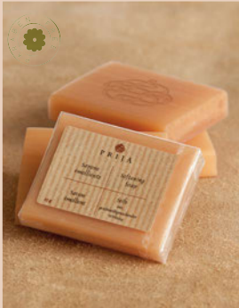
B1625PR Softening soap 25 g