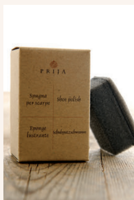
F021PR Shoe polish