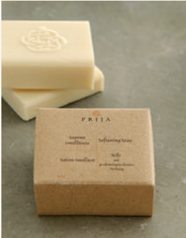
B037PR Softening soap 40 g