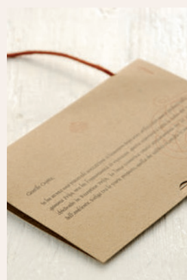
CARTPR door hanger with indication of Prija range