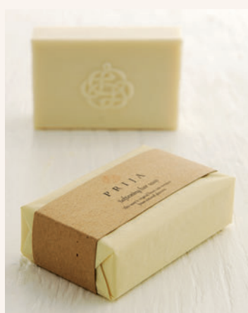
B0150PR Softening soap 150 g