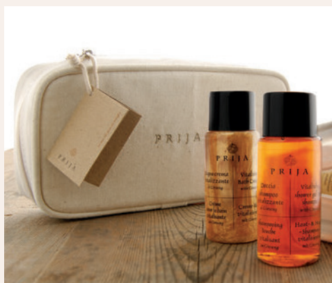
K08PR Purse contains: AB36EPR, LB01PR, D051PR, B033PR, AB33MPR, PET44PR, PET44BPR, PET44SPR, PET44LPR

The accessories' packaging is made of recycled paper, without the use of any glue whatsoever.