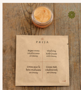
AB31BPR Vitalising Bath Cream with Ginseng 12 ml