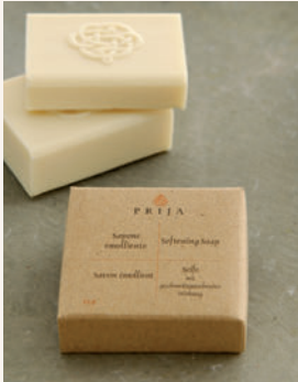
B033PR Softening soap 25 g