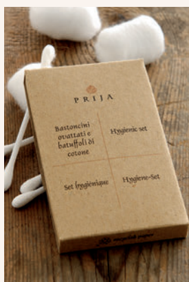
D051PR Hygienic set