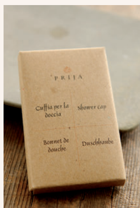
C021PR Shower cap