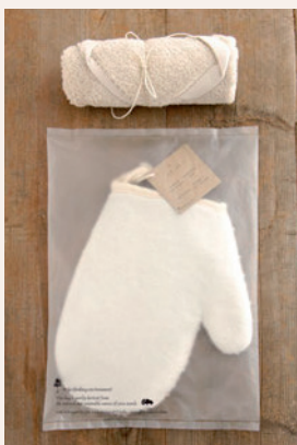
SP096PR Smoothing bath glove