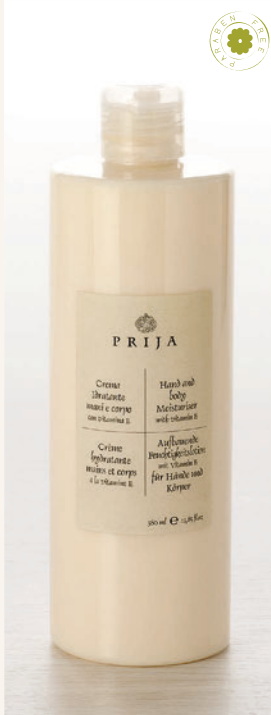
FLR400BLPR Hand and body Moisturiser with vitamin E 380 ml