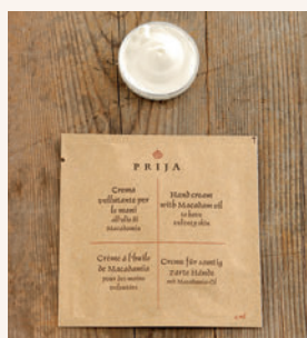
AB33MPR Hand cream with Macadamia oil to have velvety skin 4 ml