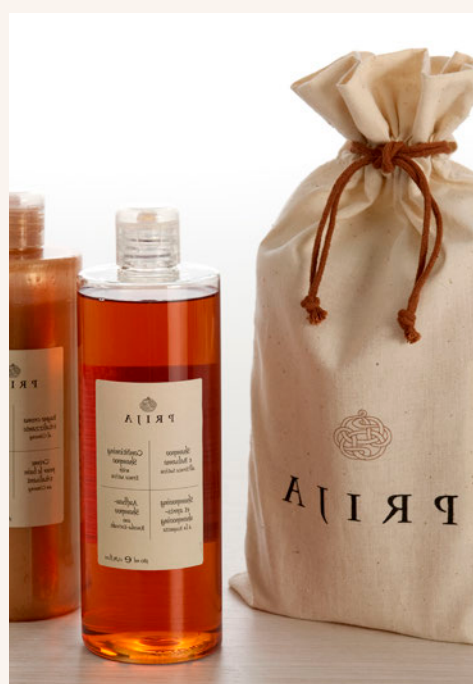
KIT2NPR Kit, contains: FLR400SPR, FLR400BPR