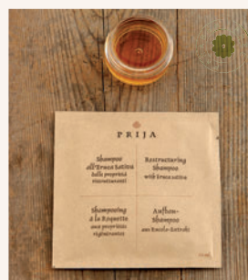
AB32SPR Restructuring Shampoo with Eruca Sativa 10 ml