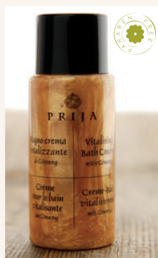
PET44BPR Vitalising Bath Cream with Ginseng 40 ml