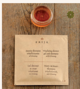
AB30PR Vitalising shower gel and shampoo with Ginseng 15 ml