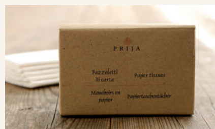
H081PR Paper tissues