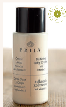
PET44BLPR Restoring Body Cream with vitamin E 40 ml