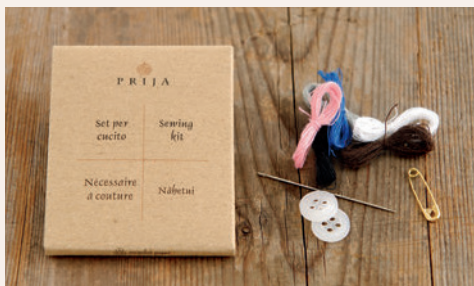
C071PR Sewing kit